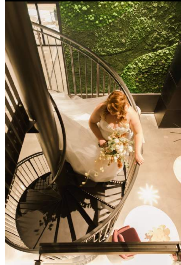
Library staircase & moss wall