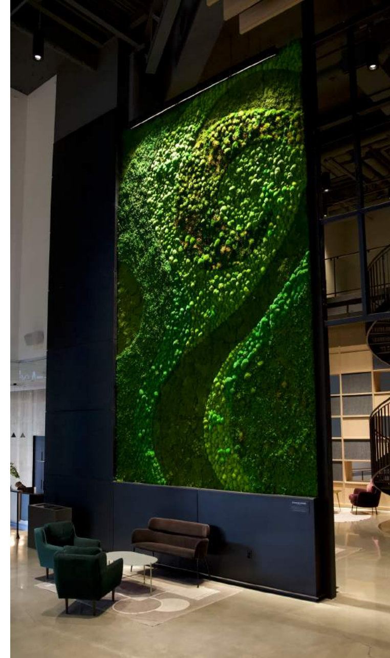
Gordon Milne Photo Gallery