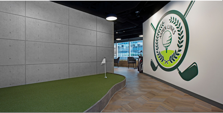
ASPEN LINKS GOLF LOUNGE