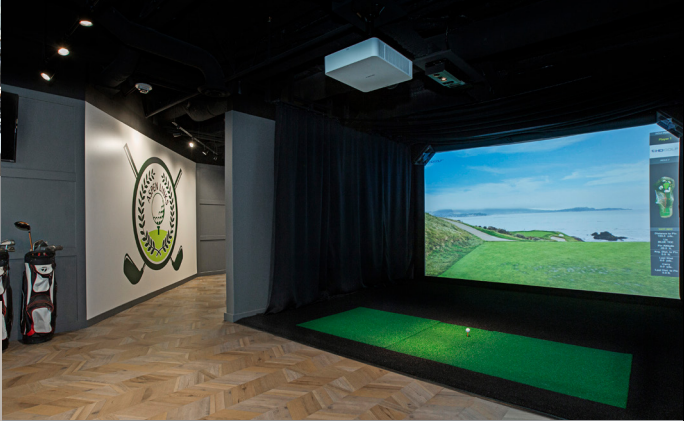
ASPEN LINKS GOLF SIMULATOR